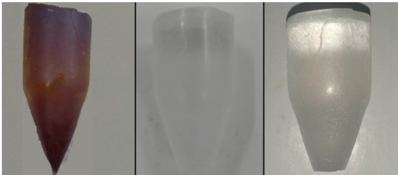
Figure 2: CsI:Br as it left the Bridgman oven (left), and the same crystal after the second heat treatment with its tip cut off (center and right).

Fig. 3 shows alpha spectroscopy results for ^{241}\text{Am} radiation (5.54 MeV) obtained with the CsI:Br crystal.