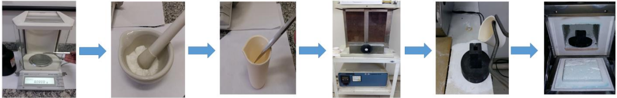
Figure 1: Flowchart of the glasses' production.

The glasses belong to the system: x\text{Nb}_2\text{O}_5-(100-x)\text{SiO}_2-\text{Na}_2\text{O}-\text{CaO}-\text{B}_2\text{O}_3-\text{Al}_2\text{O}_3 , for which niobia was added substituting silica ( \text{SiO}_2 ) 10 . The \text{Nb}_2\text{O}_5 contents (mol%) were 2-6%, named Gx ( x = \text{mol}\% ) as G0 (reference glass), G2, G4 and G6. A flowchart of the glass production is shown in Figure 1. The powders are individually weighed, mixed and homogenized, transferred to alumina crucibles, and taken to the furnace (1300°C) during 2h. Then, the melts are poured into molds and taken to the annealing furnace at 430°C during 4h, cooling after in natural conditions.